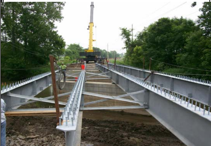
Galvanized steel beams in place and cross frames being installed

Soon after bridge 63-2.63 is completed the County Road 63 paving project will resume. In May of 2009 County Road 63 was paved from the Quincy Corporation line to the construction limits east of the new James K. Cox Bridge spanning the railroad tracks. Paving will resume at the railroad bridge eastern construction limit and continue through County Road 63 termination at the DeGraff corporation line east of the bridge 63-2.63 project.