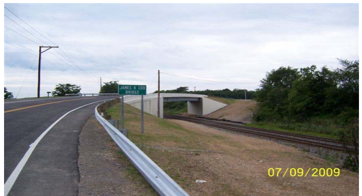
View of the completed bridge from the DeGraff side.