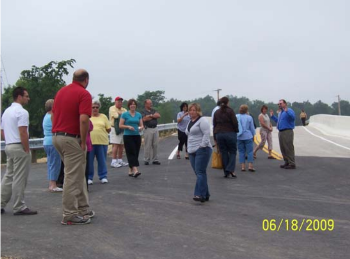
Visitors arrive before the dedication ceremony to get a prime view of the completed bridge.