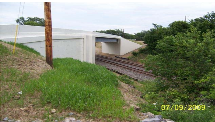
View of the completed project from the Quincy side.